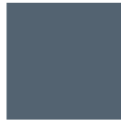
Zen Grey Ref 6005