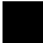
Deep Black Ref 8502