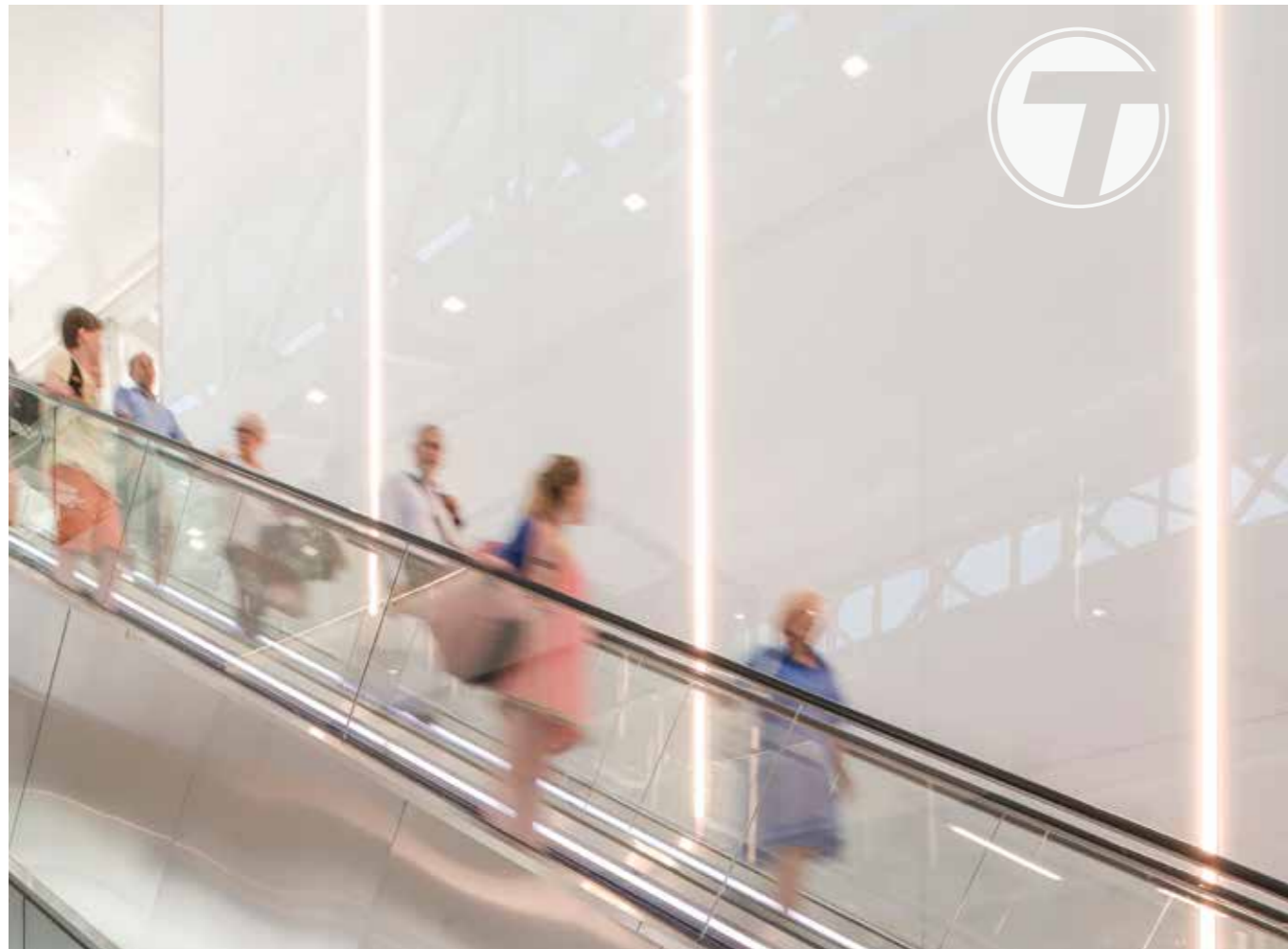
BELGIUM BRUSSELS AIRPORT, WALL CLADDING, LACOBEL T COOL WHITE