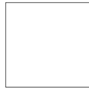
Crisp White* Ref 1000