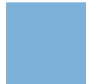
Light Blue Ref 1413