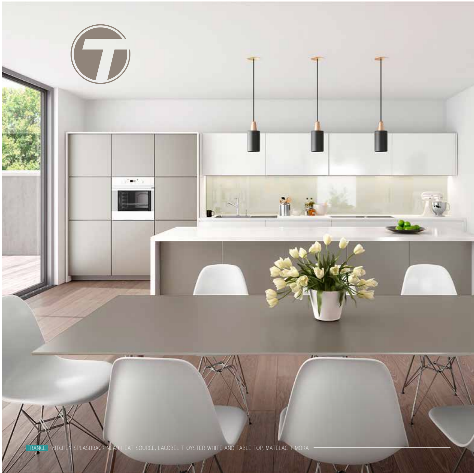
FRANCE KITCHEN SPLASHBACK NEAR HEAT SOURCE, LACOBEL T OYSTER WHITE AND TABLE TOP, MATELAC T MOKA