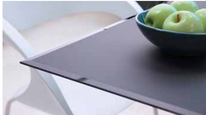
POLAND TABLE TOP, MATELAC T DEEP BLACK

Other exterior applications – Outdoor furniture, exterior partitions