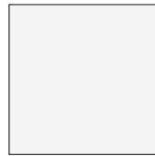
Cool White Ref 1502