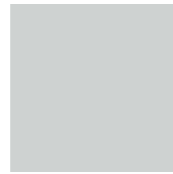
Misty White Ref 5813