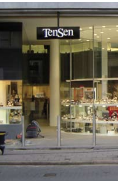
Planibel Clearvision in laminated Stratobel in jewelry shop window

* In this document, AGC stands for AGC Flat Glass Europe