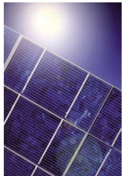
Planibel Clearvision, perfect for solar applications