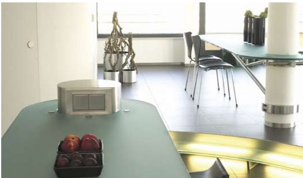
Planibel Linea Azzurra in satin version Matelux